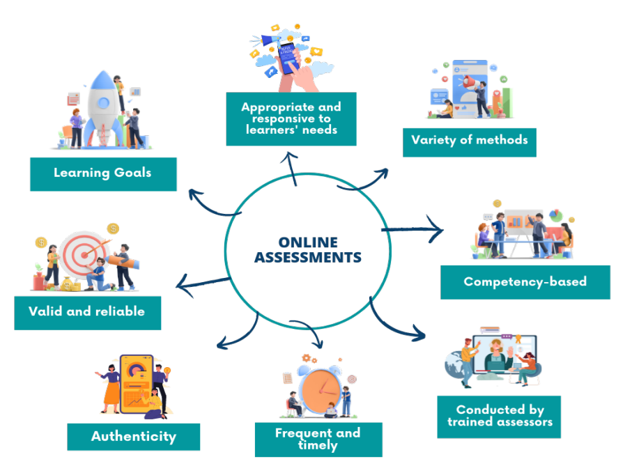
Fig 1. Pedagogical online assessment guidelines

Apart from being valid, reliable, and focused on learning objectives, good online assessments must also vary according to the needs of students. In addition to using different online platforms, various learning styles beyond surface learning, such as problem-based learning, portfolios, simulations, and many others must be considered. In addition, the entire assessment process must be based on students' competency and carried out with the proper mechanism, namely by providing frequent and timely constructive feedback. In the meantime, authenticity is defined as original assessments, avoiding copyright violations, and referring to a well-designed evaluation in students' real-time situations. Thus, some training is necessary for assessors to create online practice assessments.