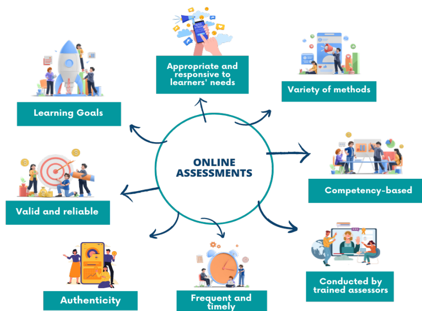
Fig 1. Pedagogical online assessment guidelines

Apart from being valid, reliable, and focused on learning objectives, good online assessments must also vary according to the needs of students. In addition to using different online platforms, various learning styles beyond surface learning, such as problem-based learning, portfolios, simulations, and many others must be considered. In addition, the entire assessment process must be based on students' competency and carried out with the proper mechanism, namely by providing frequent and timely constructive feedback. In the meantime, authenticity is defined as original assessments, avoiding copyright violations, and referring to a well-designed evaluation in students' real-time situations. Thus, some training is necessary for assessors to create online practice assessments.